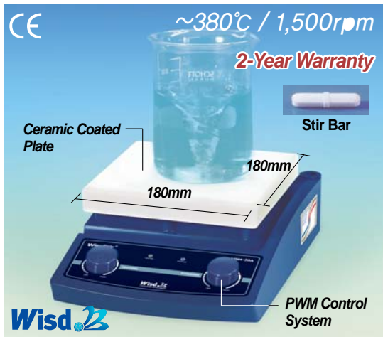
180×180mm Plate-type Hotplate Stirrer "MSH-20A"

DAIHAN-brand® Premium Hotplate Stirrer, "MSH-A", Ceramic-Coated Plate, up to 380°C, 1,500 rpm, with Certi. & Traceability Built-in Linearity PWM Controller, Superior Temperature Uniformity, Precise Control of Temp. & RPM, 180×180mm or 260×260mm 아날로그 가열 자력 교반기, 우수한 온도균일성, 세라믹 코팅 플레이트