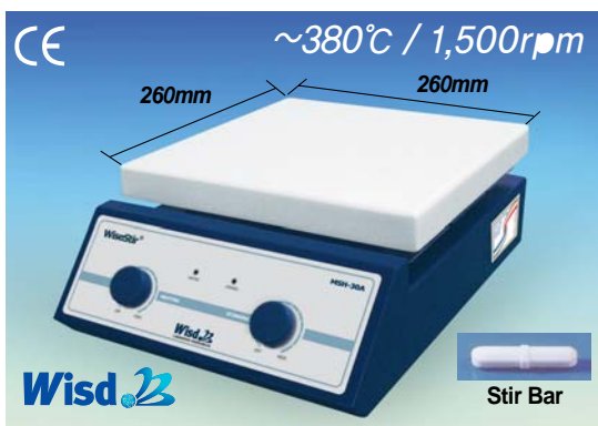
260×260mm Plate-type Hotplate Stirrer "MSH-30A"