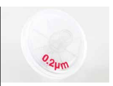
0.2 micron disc filter protects from contamination