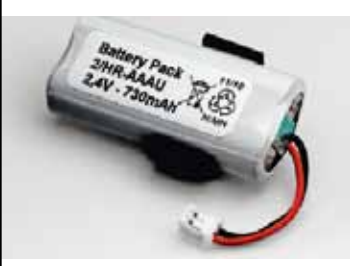
Long life battery for extended operation